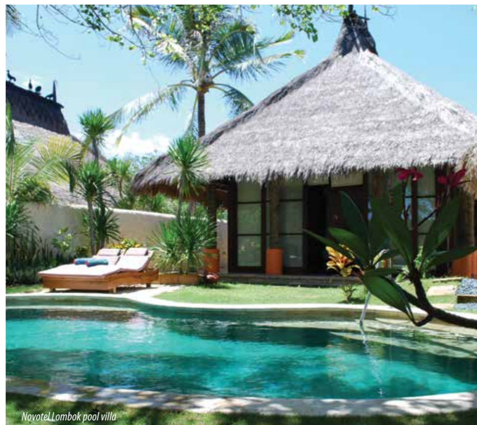
Novotel Lombok pool villa

Holiday workshops seem to be popping up all over the place with Casa Luna Cooking School in Ubud, seducing aspiring cooks