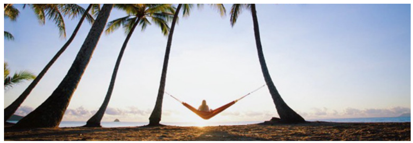
Palm Cove Beach.