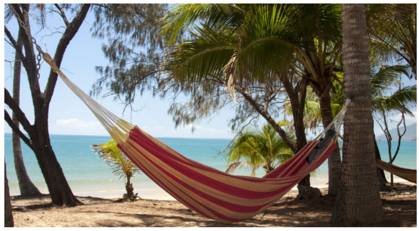
Thala Beach Nature Reserve, Port Douglas