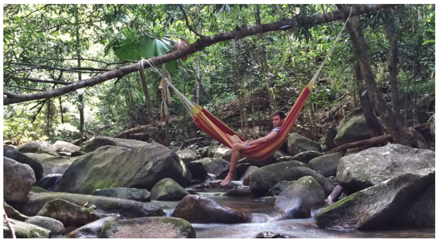
A freshwater creek in the Daintree.