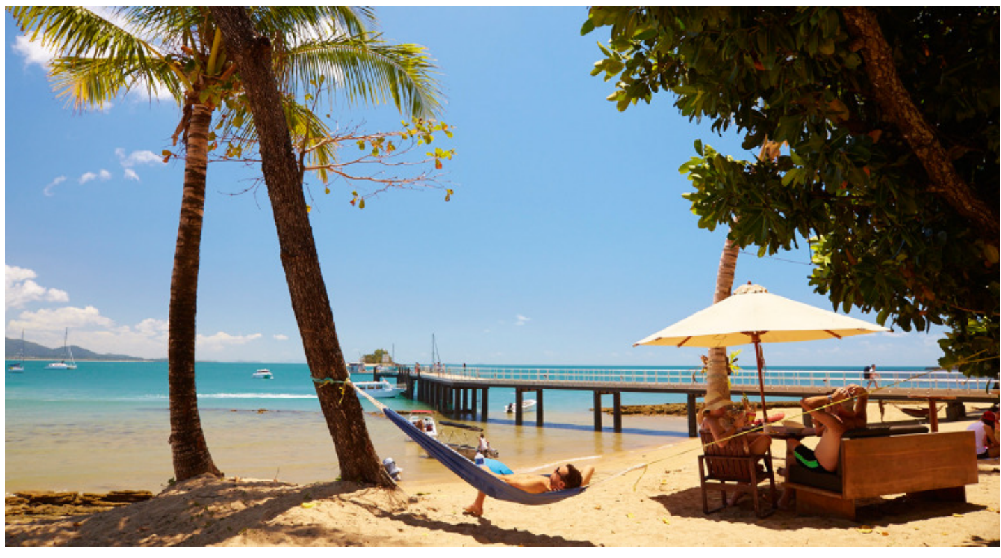
Dunk Island.

In Tropical North Queensland we like to think we've perfected the art of hammocking. It helps that we have an unlimited supply of obliging palm trees to swing from! Enjoy some of our favourite hammocking spots.