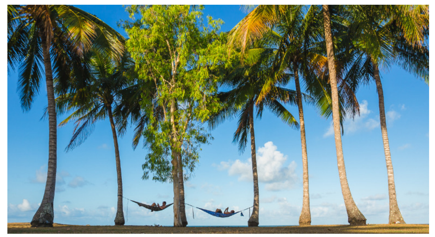
Rex Smeal Park, Port Douglas.