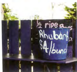
Light and simple THE HINTERLAND IS HOME TO PLENTY OF FRESH PRODUCE

艰辛的爬山狂热分子的路程，另外还有短至数分钟，由停车场至观景台的路线可供选择。雷明顿国家公园、春溪国家公园(Springbrook National Park)或地势较低的那明巴谷(Numinbah Valley)都是著名的爬山径，有些路径沿着潺潺的溪流，有的通向瀑布或贯穿整个森林。在这里有全球最密集的亚热带雨林及温带雨林，还有澳大利亚仅余的寒温带山毛榉森林，澳大利亚世界遗产保护区——岗