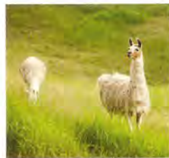
Animal instinct GET UP CLOSE AND PERSONAL WITH THE LOCALS, INCLUDING THESE ALPACAS

以位于雷明顿国家 公园（Lamington National Park）入口 的小城镇卡伦格拉 （Canungra）为例， 曾经是一座以伐木工 业为业的小镇，随着 地主将农地发展为葡 萄园旅游，酿酒旅游 业开始陆续浮现。农 庄民宿或豪华旅舍， 如辣椒鲁非尔温泉旅 舍（Peppers Ruffles Lodge）