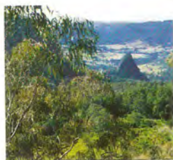
Natural glory THE VIEW FROM - AND INSIDE - THE GOLD COAST HINTERLAND IS BREATHTAKING