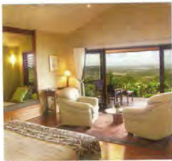
Love is in the air PEPPERS RUFFLES LODGE & SPA IS A PERFECT AWAY-FROM- IT-ALL BREAK FOR COUPLES

and Spa) 便是主要观光点之一。此处受到广大情侣的喜爱，作为远离尘嚣、周末浪漫渡假的好去处，浪漫氛围不分四季地充斥於富有建筑美感的建筑内。这是一处适合您无论是慵懒地在床上享用早餐、边享受精致晚餐边品尝美酒、漫步於自然环境还是在私人泳池边看著 Paulo Coelho 小说边放松的地方，而且还有越来越受欢迎的休閒水疗，是令女士为之奔走的必备行程之一。