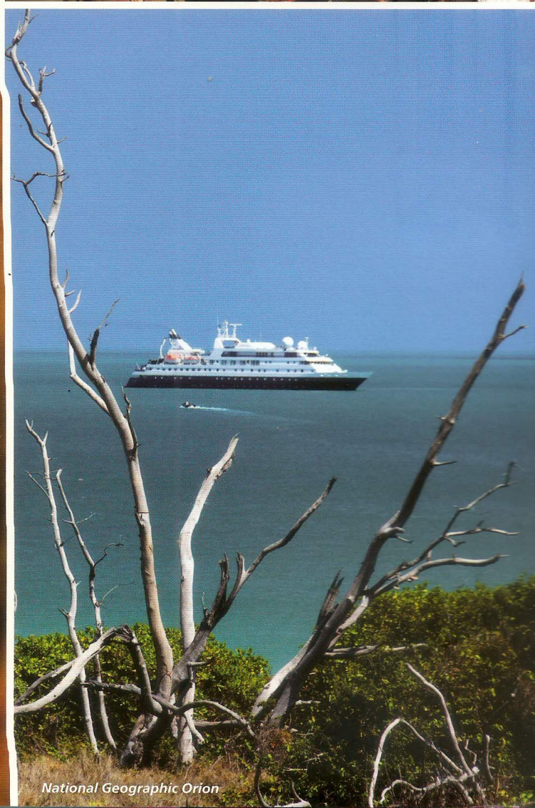
National Geographic Orion