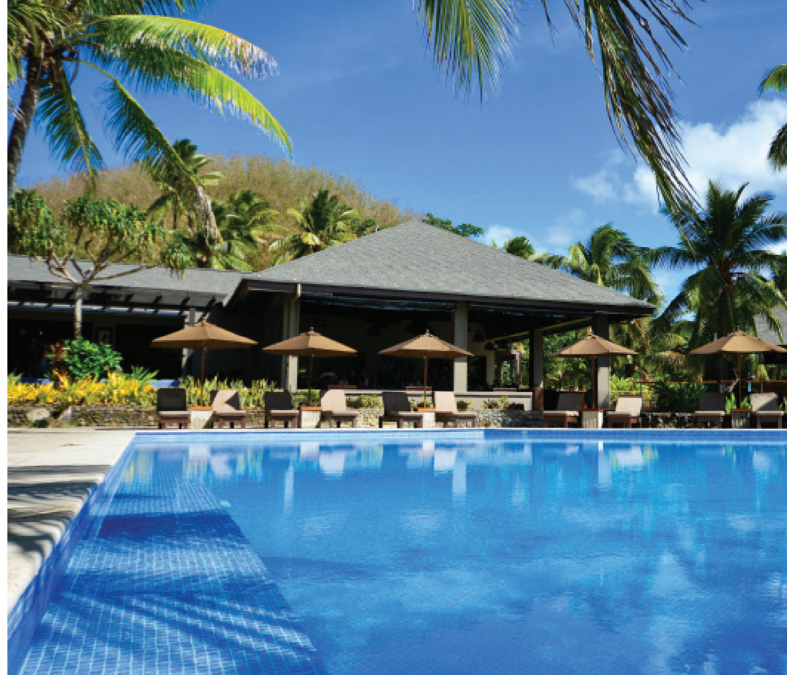
Yasawa Island Resort's main bure offers plenty of room to do, well, nothing if you choose.