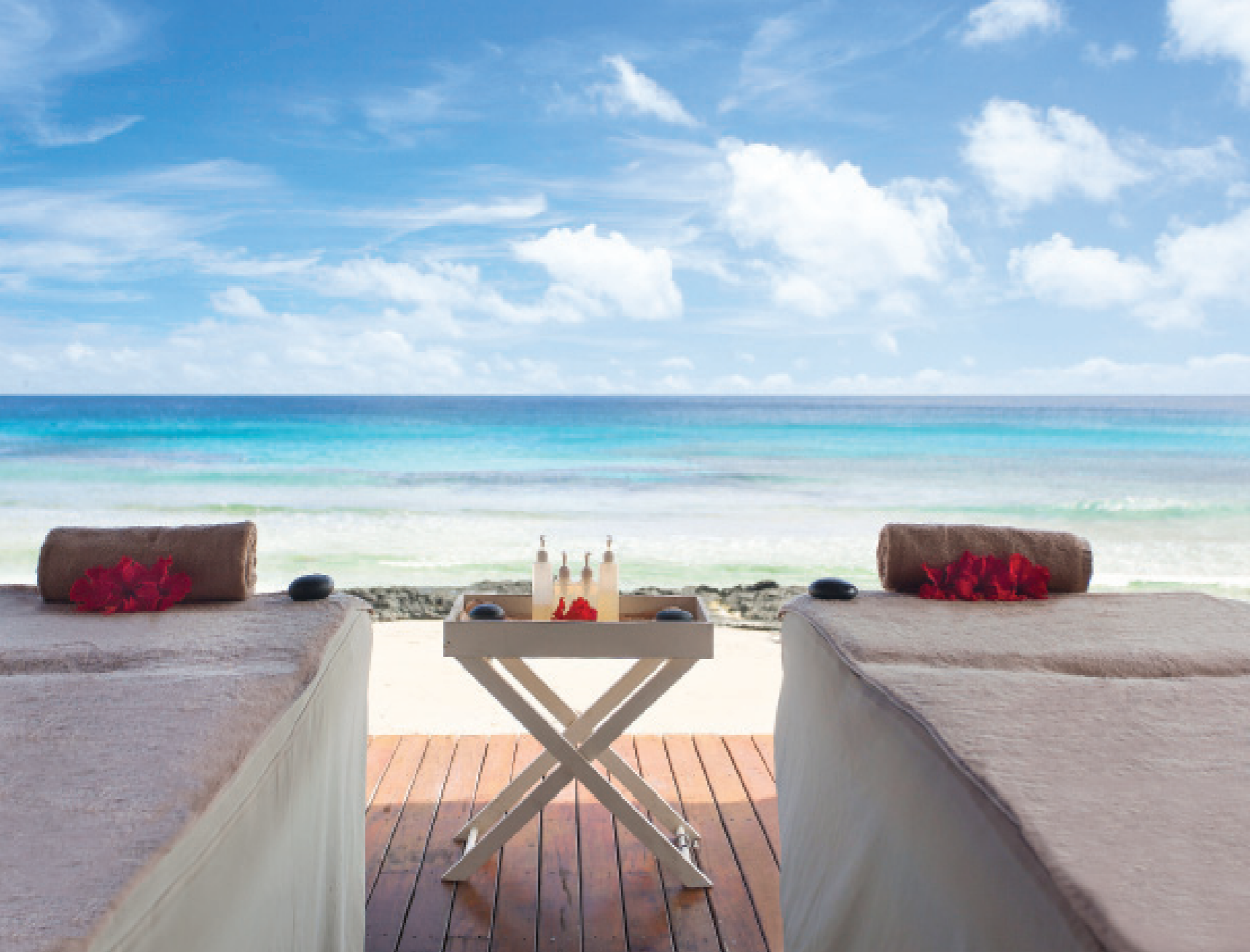
A massage with a view or a snorkel over clear waters? The Yasawas are the true heart of beautiful Fiji.