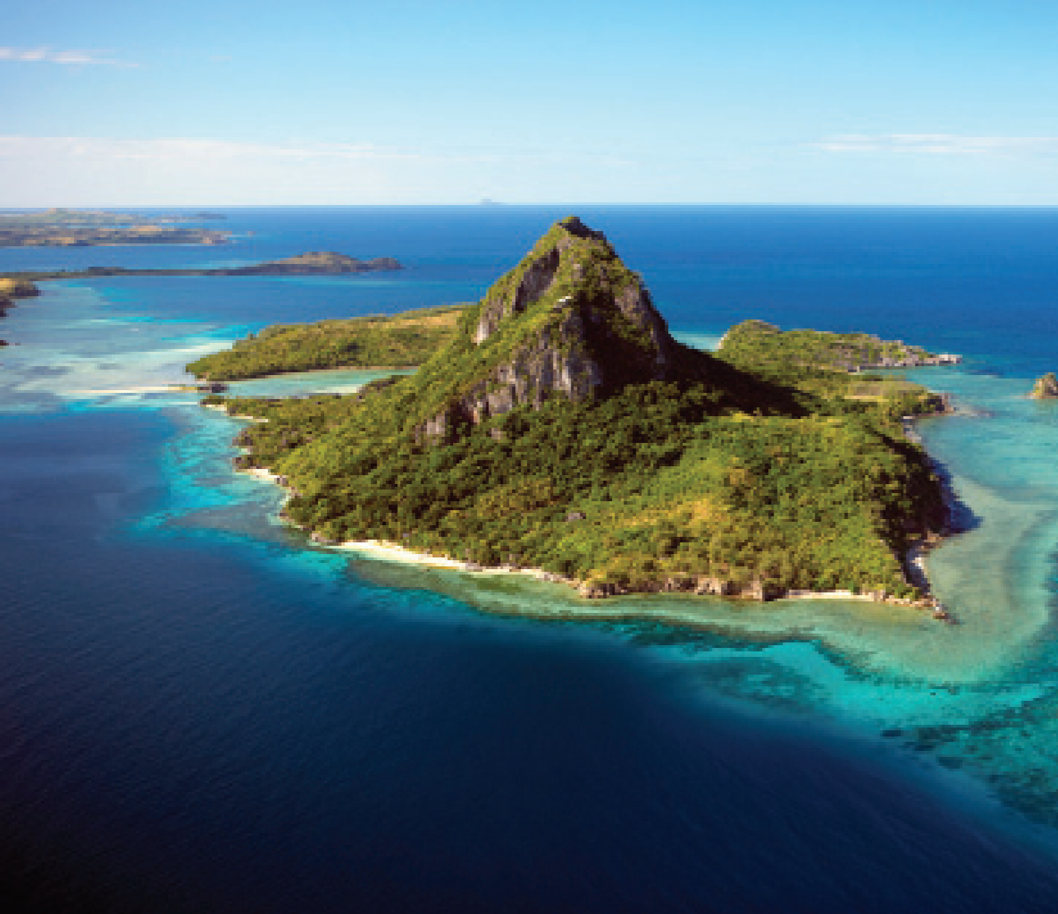
Above: Now that's an island! Fringed by coral reefs, a nice mountain in the middle, sandy beaches and lots of greenery, perfect.

coral reefs and forest-clad islands, new arrivals are greeted like long lost friends returning home.