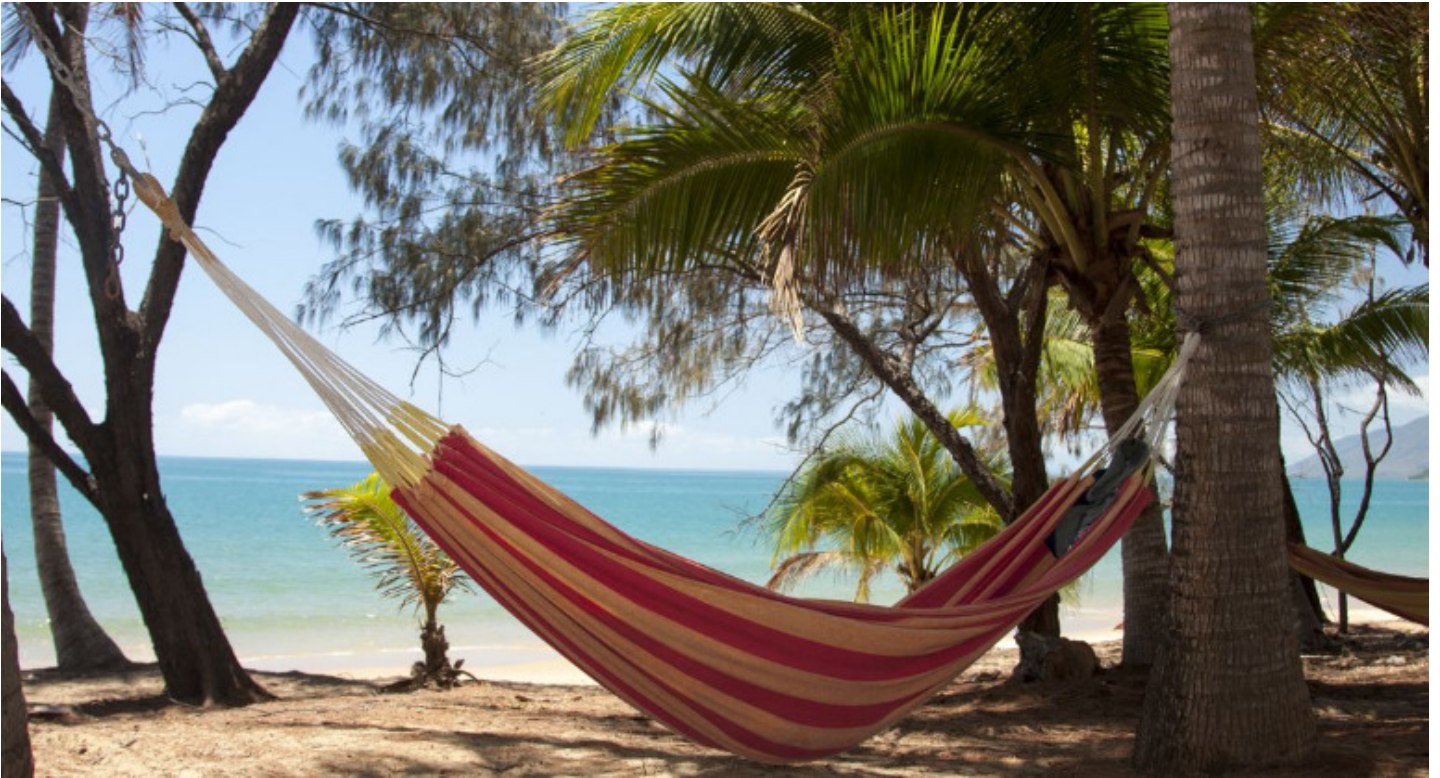
Thala Beach Nature Reserve, Port Douglas