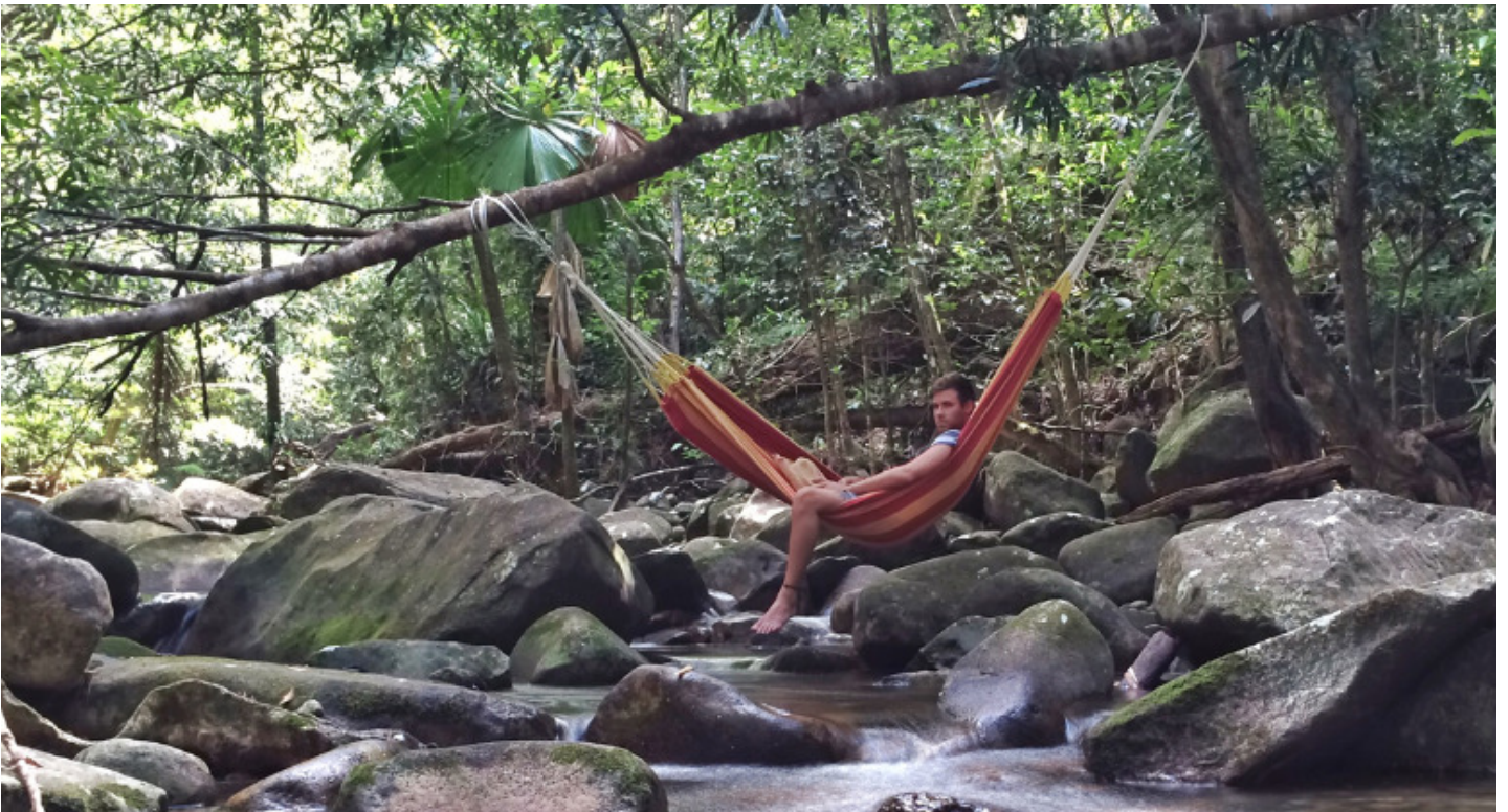
A freshwater creek in the Daintree.