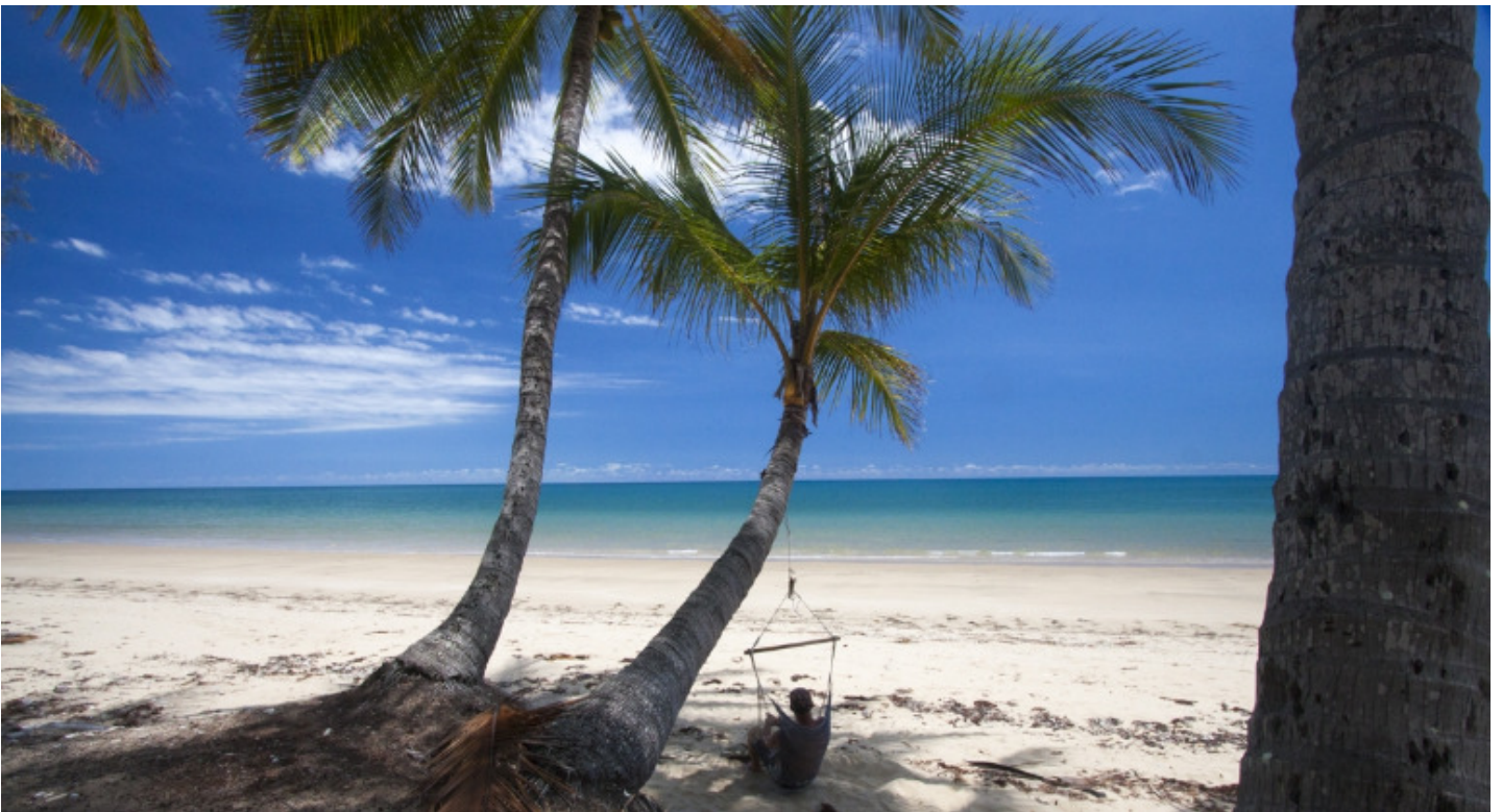
Oak Beach, Port Douglas.

Where is your favourite spot to string up a hammock? Let us know in the comments below.