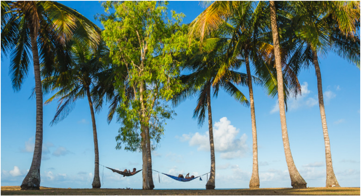
Rex Smeal Park, Port Douglas.