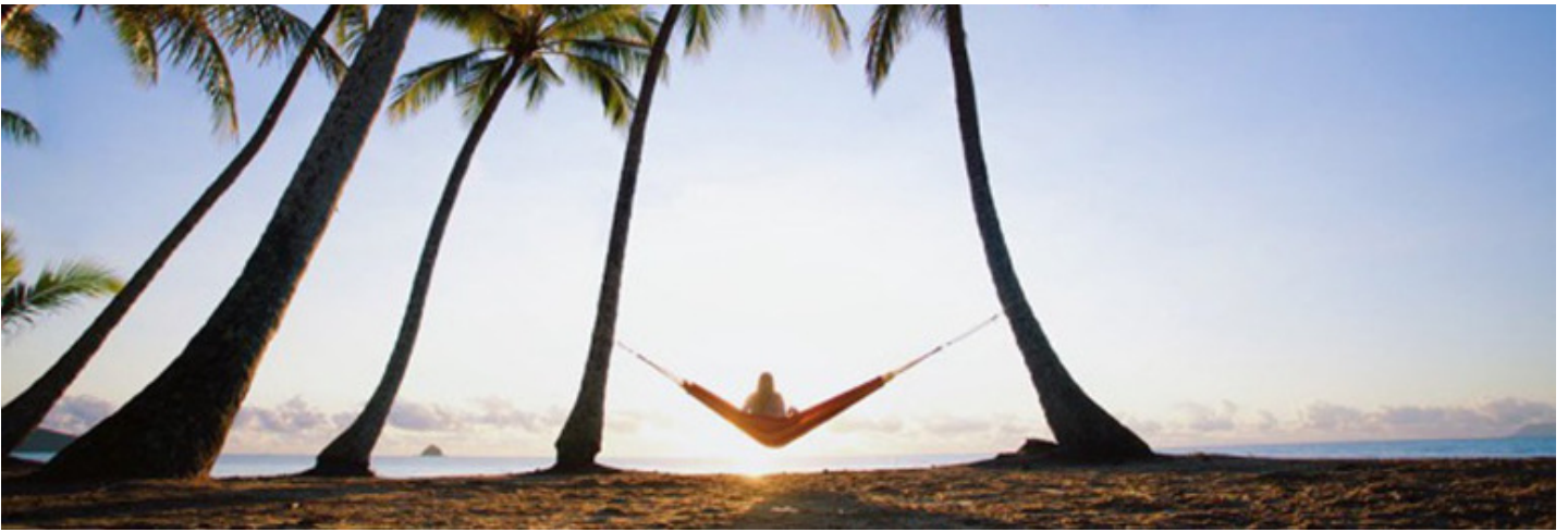
Palm Cove Beach.