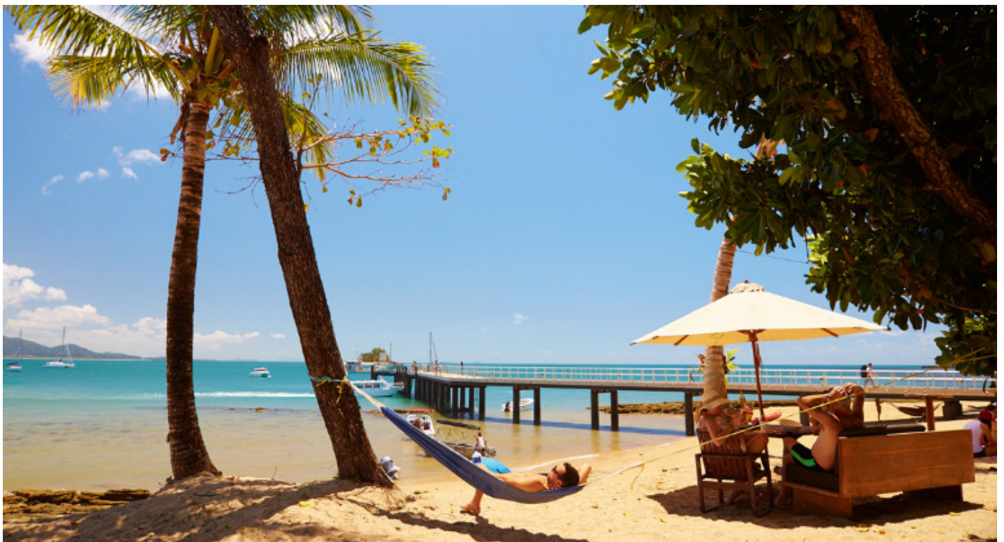
Dunk Island.

In Tropical North Queensland we like to think we've perfected the art of hammocking. It helps that we have an unlimited supply of obliging palm trees to swing from! Enjoy some of our favourite hammocking spots.