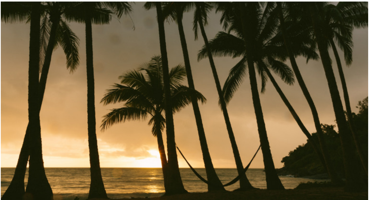
Turtle Cove, between Cairns & Port Douglas.