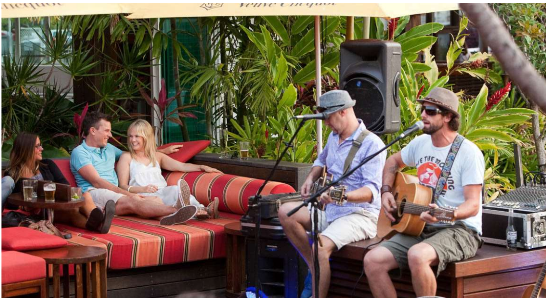
Musician: Yeah sure, sitting round the bar strumming a few tunes & drinking beer is a job. We believe you. Really we do.