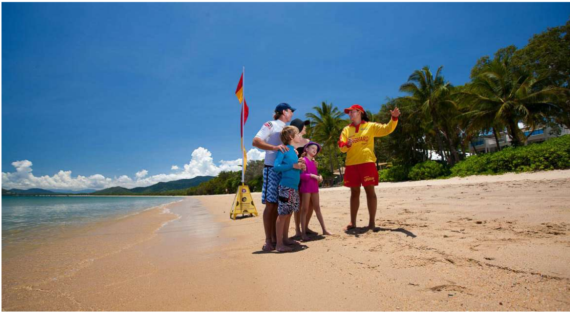
Lifeguard: 'Which way to the beach?' Lifeguards need the patience of Job. (that's Job, rhymes with lobe, as in the Biblical figure, not job, rhymes with lob... oh never mind)