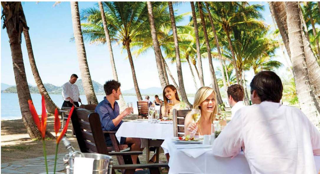
Chef: Who would want to work in such appalling conditions? Sunshine, sand & there's way too much fresh air! It's no wonder he's turned his back on that blinding ocean.