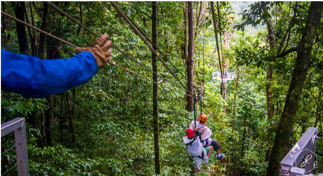
The Cable Guy: that's probably not the job description on his tax return but it seems appropriate for the treetop fella at Jungle Surfing Canopy Tours .