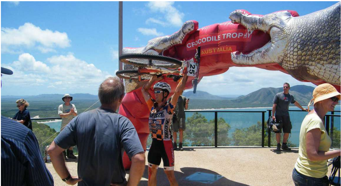
Mountain Biker: It doesn't sound like a real job but it is for some. Particularly for those Pros who contest the annual Crocodile Trophy.