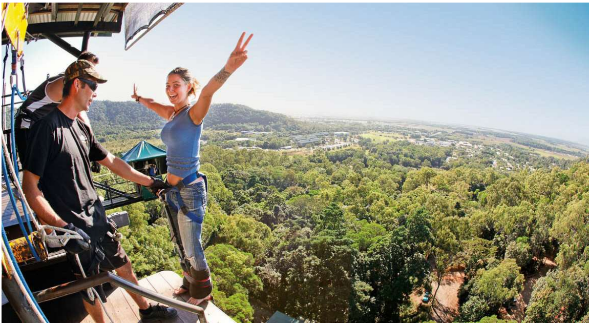
Bungee Jump Operator: Don't even think about this AJ Hackett Bungee job if the thought of this view from your office turns your legs to jelly. Jumping home is optional.