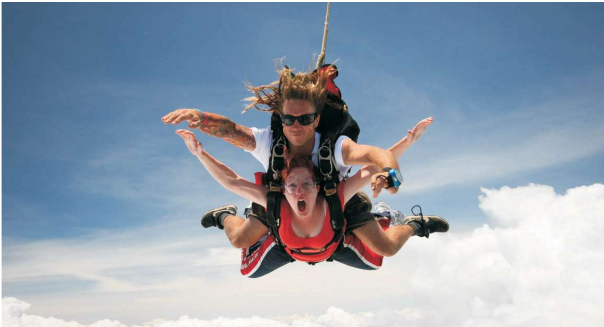
Skydive Instructor: Another easy one. The 'cool job guy' is the one looking super cool despite free-falling through the sky. The holiday maker on the other end looks terrified. In a good way!