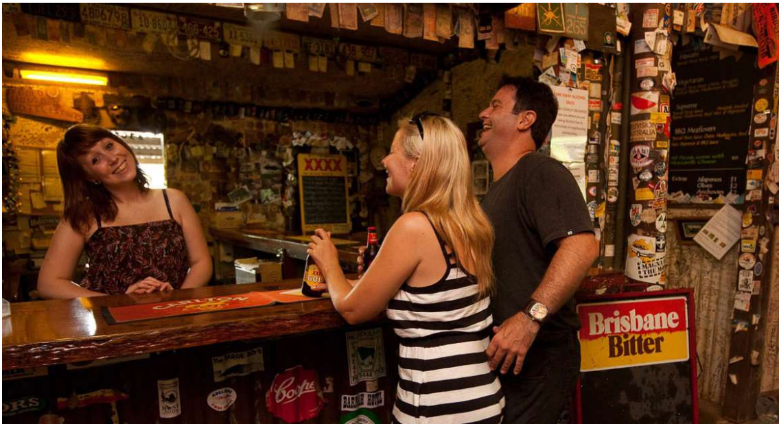
Bar Attendant: It's not all beer & skittles manning the bar in an Outback pub. Actually, there is beer. Lots of it.