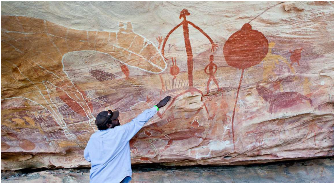
Rock Art Guide: How do you explain cultural artifacts almost as old as time itself? That's the challenge facing Rock Art Guides at ancient Laura rock art sites.