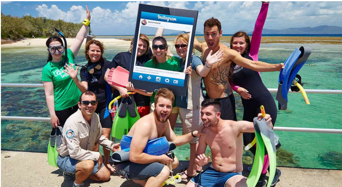
Instagrammer: Who knew that a quirky little smartphone app would launch Instagrammer careers? These guys at the Green Island Instameet are on to it!