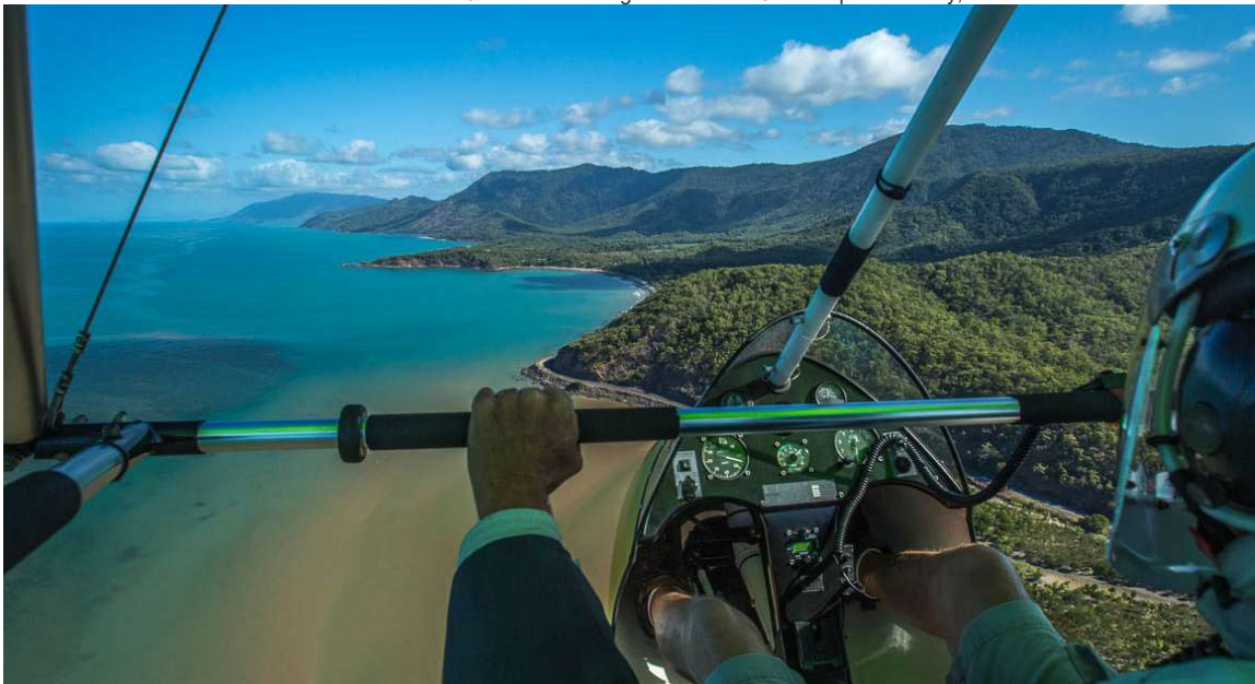
Microlight Pilot: What goes up must come down. The tricky part of microlight flying is the pesky landing part. Otherwise it's all blue skies and tail winds.