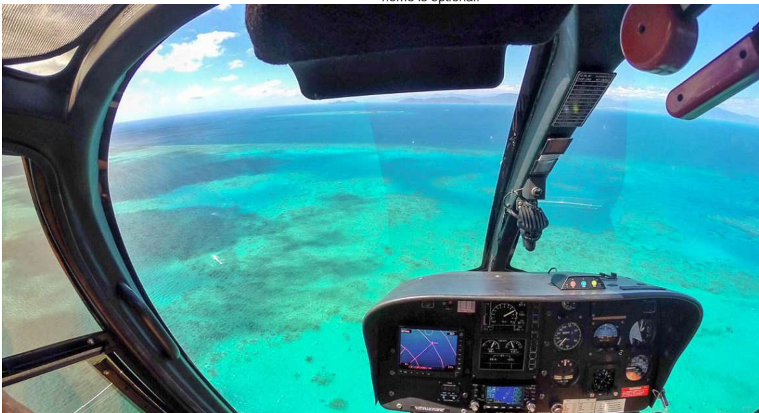
Helicopter Pilot: Poor old chopper pilots have to contend with monotonous greens and blues on their daily commute. Ya gotta feel sorry for them.