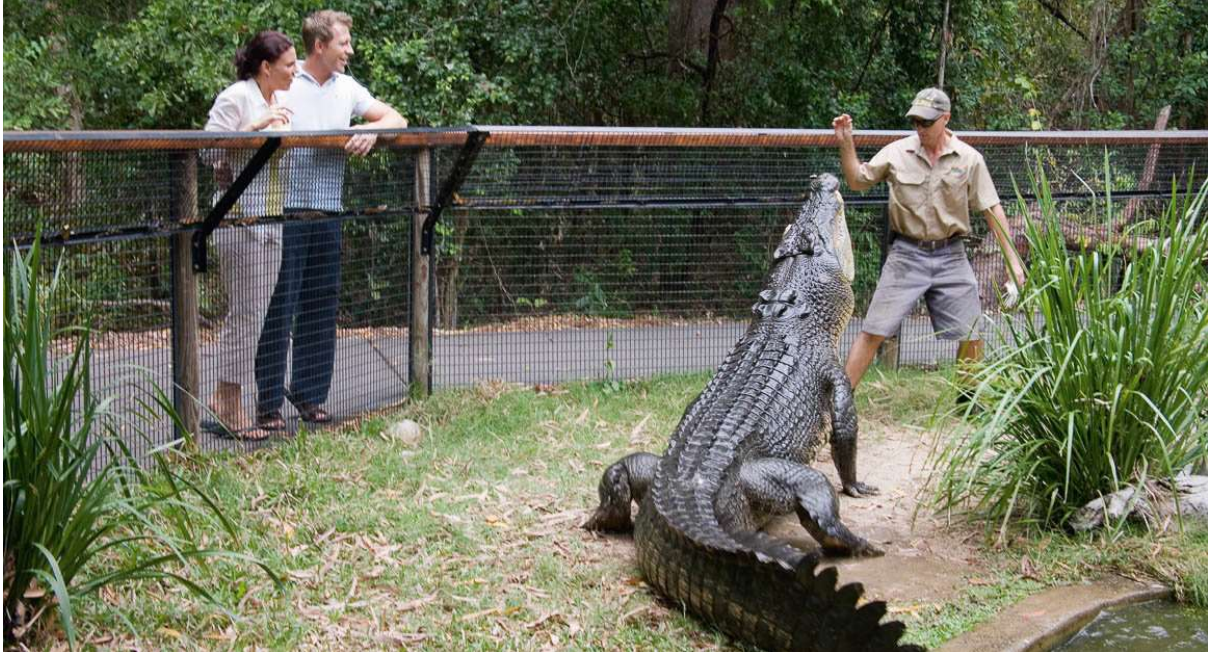
Crocodile Keeper: this is an easy one! Children don't try this at home.

We're going to meet some of these people over the coming months to find out about their cool jobs and whether they live up to 'dream job' status. In the meantime, here's a little teaser of what's to come as we check out 20 of the coolest jobs in TNQ. Can you work out who is working and who is on holidays?