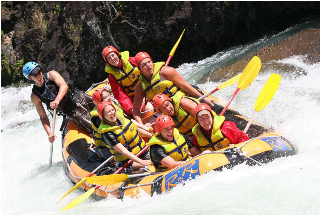
White Water Rafting Guide: It's hard to tell who's having more fun here – the thrill seeking holidaymakers or the R n R Rafting Guide.