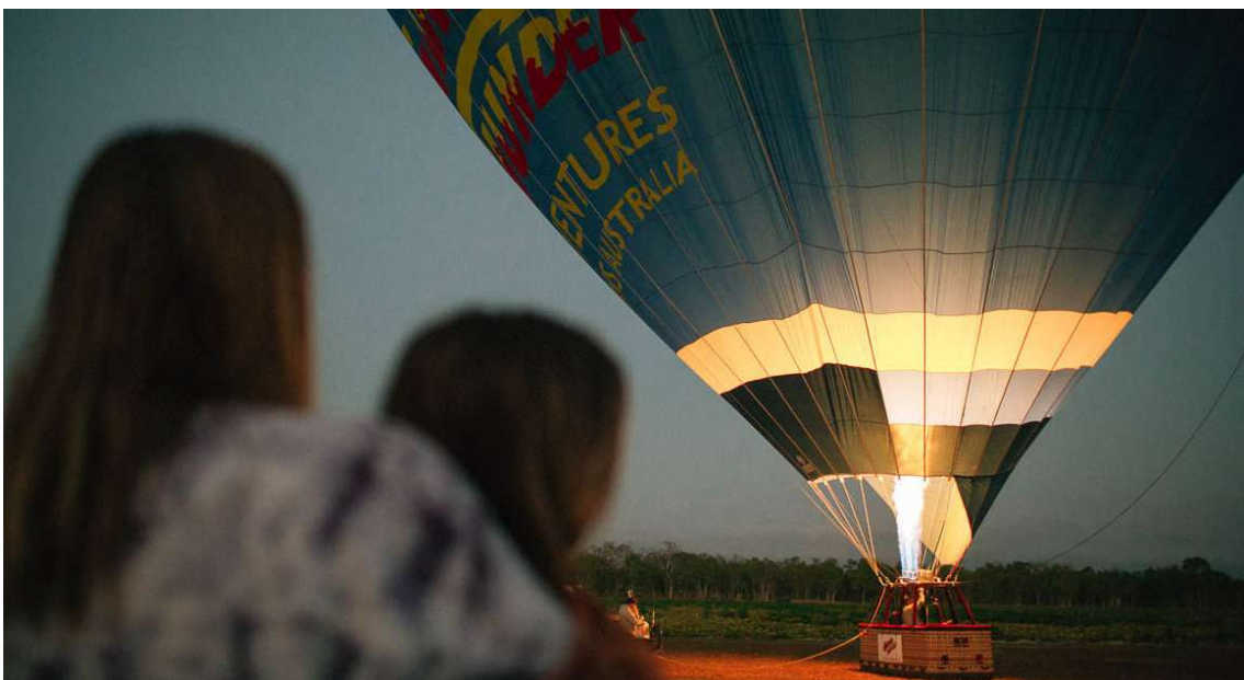
Balloon Pilot: There are few downsides to being a hot air balloon pilot. The obvious one is the early starts, but beyond that it's all plain sailing, err drifting.