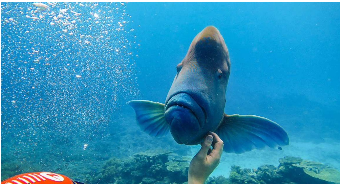
Fish Ticker: Marine Biologist is what it says on the job description but why spend all those years at Uni if you can't have a little fun with the critters you've studied?