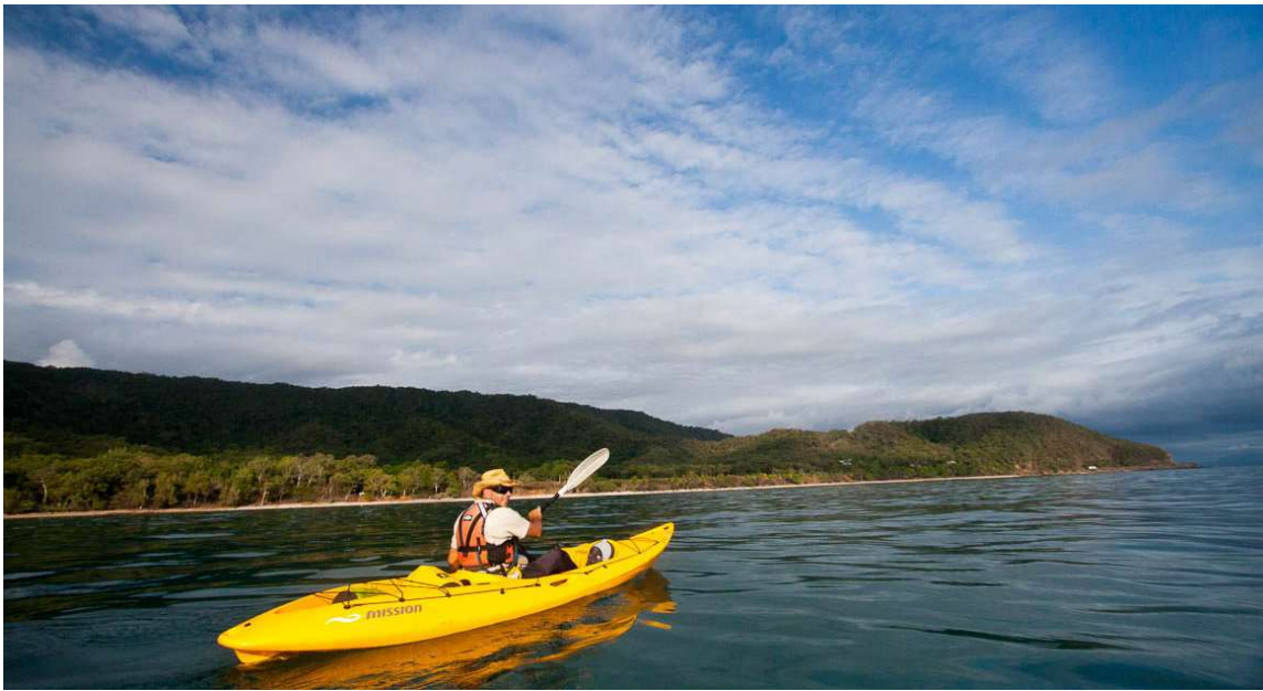
Adventure Guide: Just another day in the office for a Back Country Bliss sea kayak guide. Oh look, is that another turtle? Photo Travel Boating Lifestyle