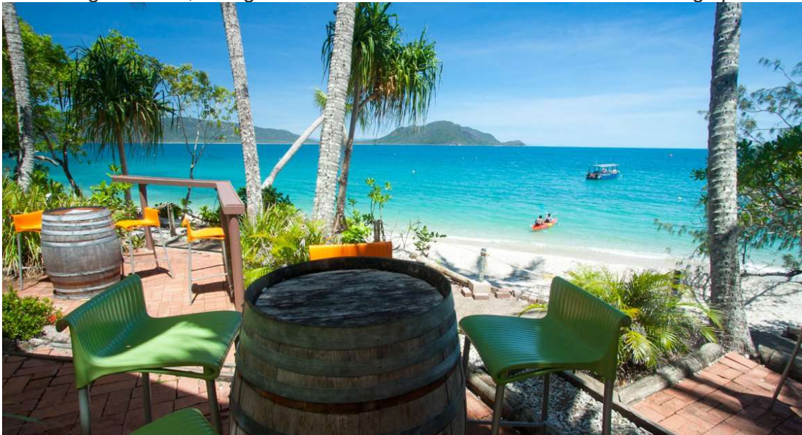
Getting hungry yet? We thought so. Foxy's bar and cafe should do nicely, thanks very much