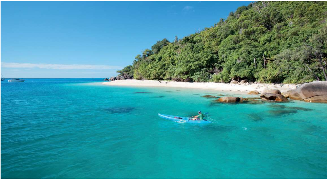
Start your day like this and it's hard to imagine life getting any better!