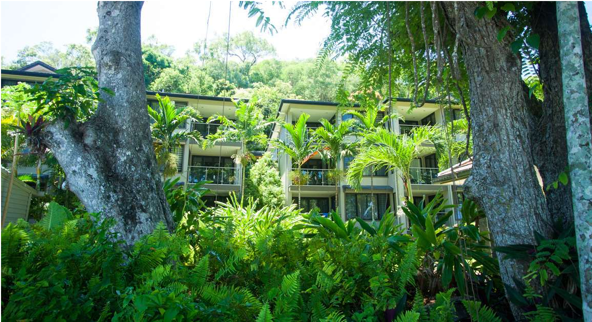
Check into an oceanfront room at Fitzroy Island Resort

Whether you want to chill out under a tree on the beach, laze by the Fitzroy Island Resort pool sipping cocktails, pitch a tent, hike to the lookout or kayak, snorkel and swim to your heart's content, you'll probably find a way to fill a couple of days on Fitzroy Island. Here's a few ideas to whet your appetite for a Fitzroy Island getaway.