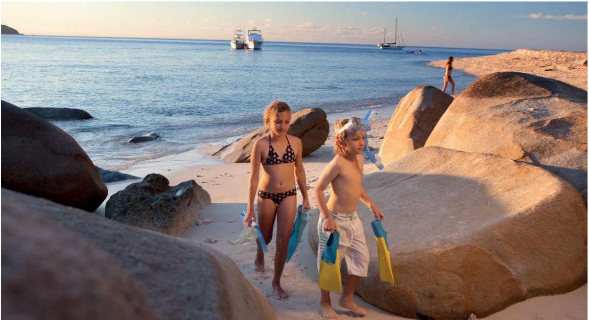
Oh go on then, let's get back in the water and find another snorkelling spot