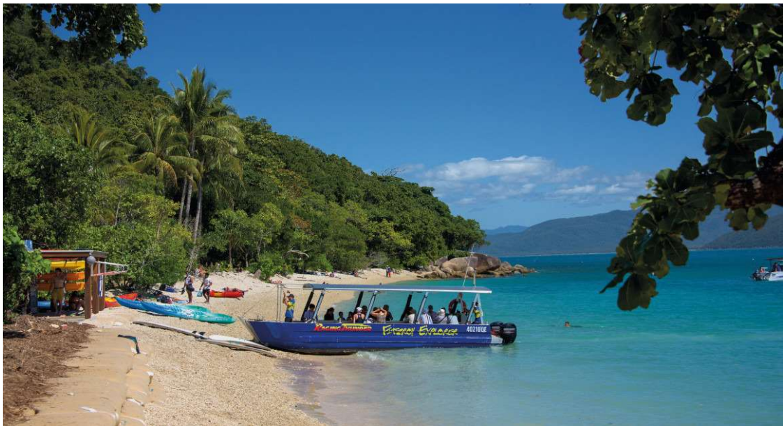
If you don't feel like getting wet take a glass bottom boat trip to view coral and other marine life