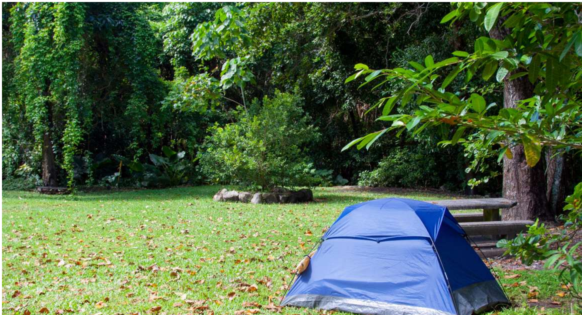
Prefer to keep things simple? Book a camping site and camp out on a Great Barrier Reef Island for about the same price as a cup of coffee