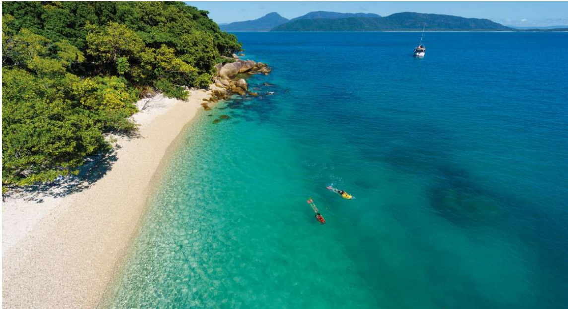
It just did