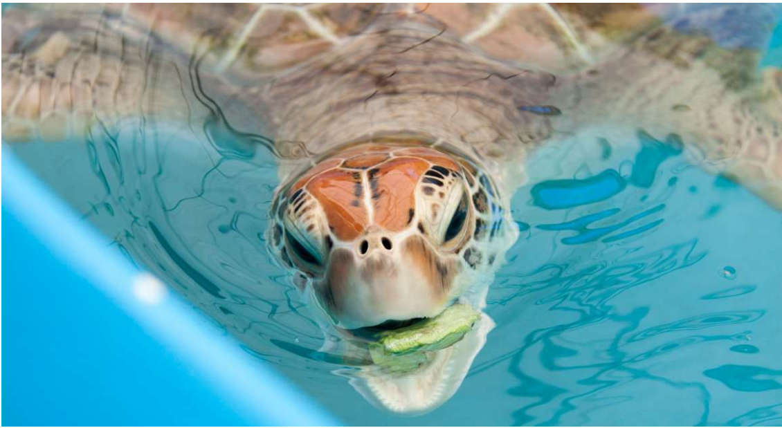
Like this fella who has hopefully gone on to live a long and happy life. It's hard to imagine living in a better place than the Great Barrier Reef isn't it?