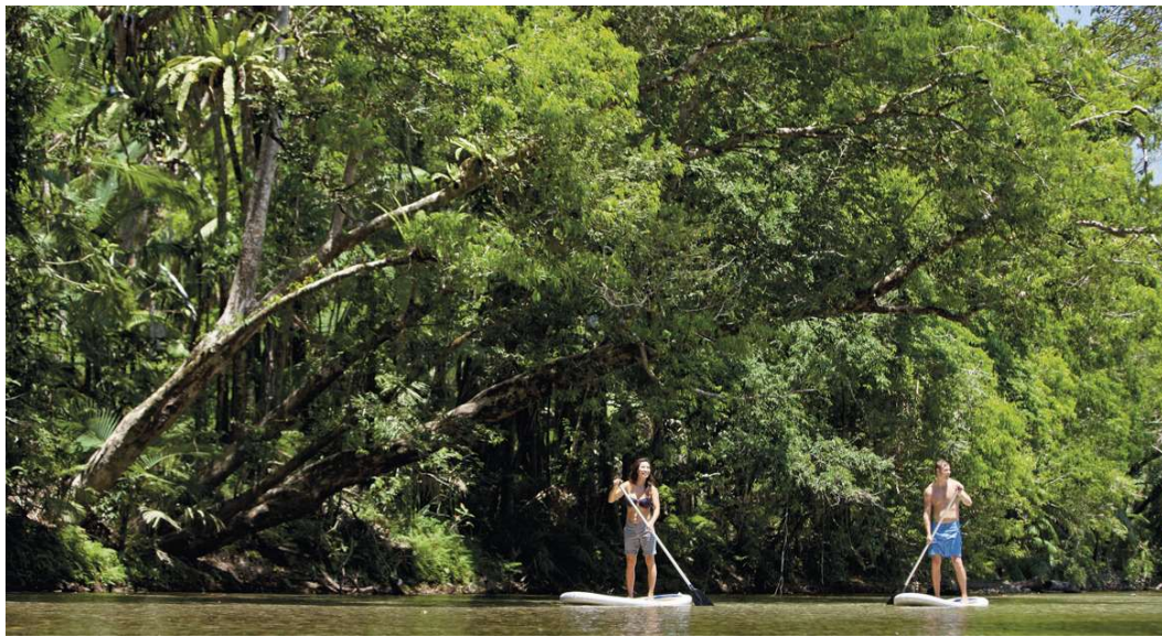
Enjoy spectacular views of the tropical rainforest, Coral Sea and Cairns on Skyrail Rainforest Cableway.