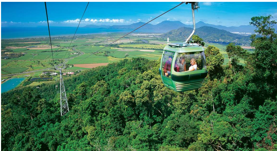
Or you could just sit quietly and take it all in. It takes time to absorb an ancient rainforest system as old time itself.