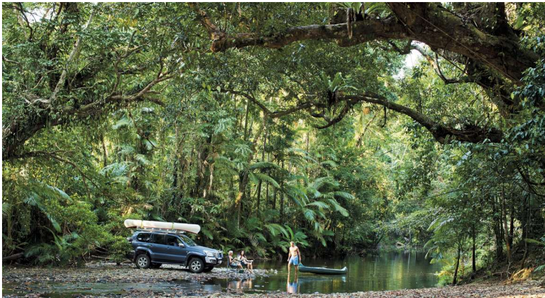
Stand up paddle boarding (SUPing!) is yet another way to explore the rainforest.