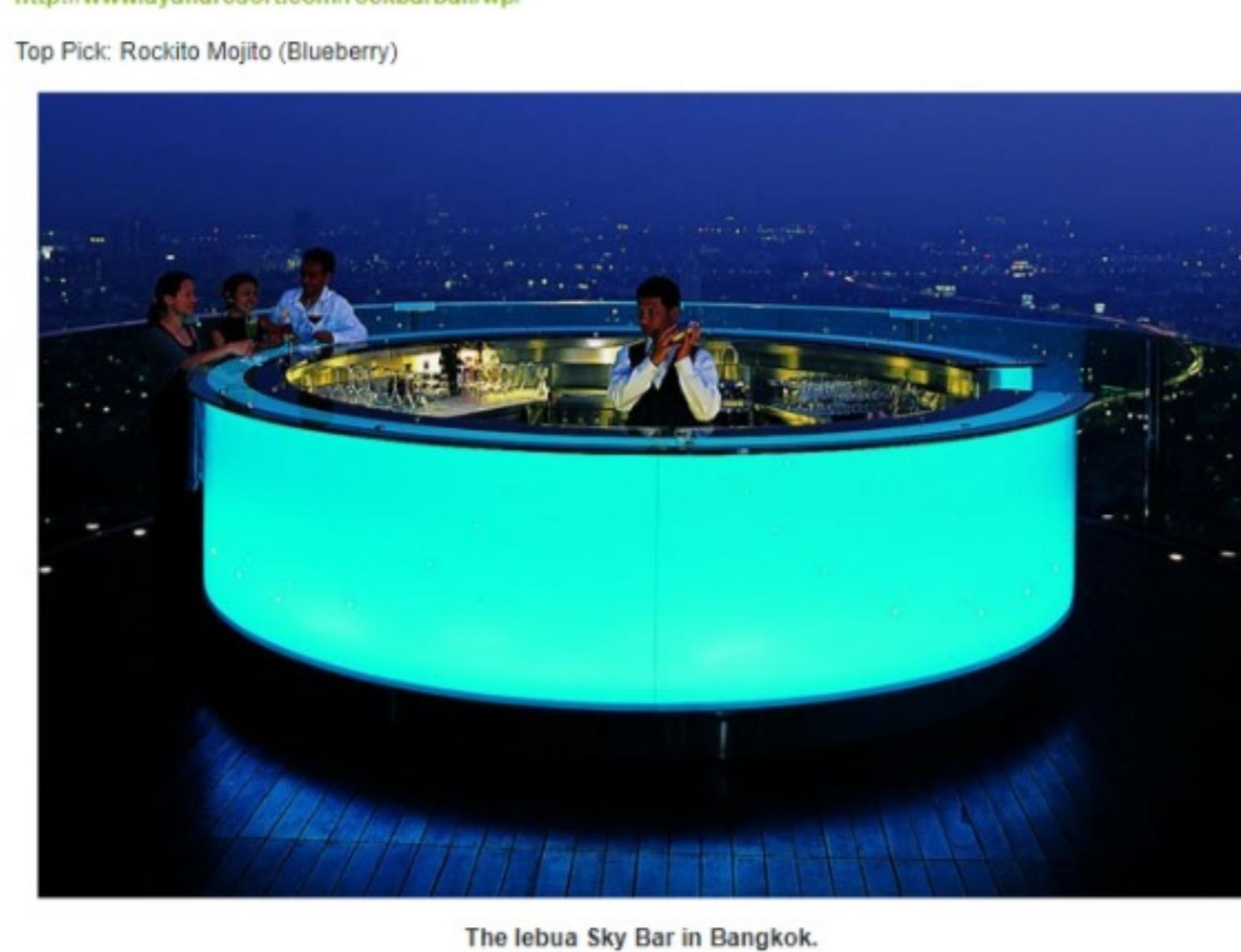
The lebua Sky Bar in Bangkok.

4. New York Bar, Tokyo Surely one of the sexiest cocktail bars this side of New York, vast walls of towering glass offer extraordinary views 52 floors above Tokyo. Scarlet Johansson may not have found herself quite so Lost in Translation had she ordered a Mojito instead of a vodka tonic when she sidled up beside Bill Murray. Intimate and mysteriously moody, Havana Club 3 year old makes Mojitos here a stand out. Don't even think of claiming a stool before dusk has descended in order to appreciate the sultry vibe of a tinkling piano. Despite the ample panorama beyond the glass, this is an "intimate liaisons" kind of spot.