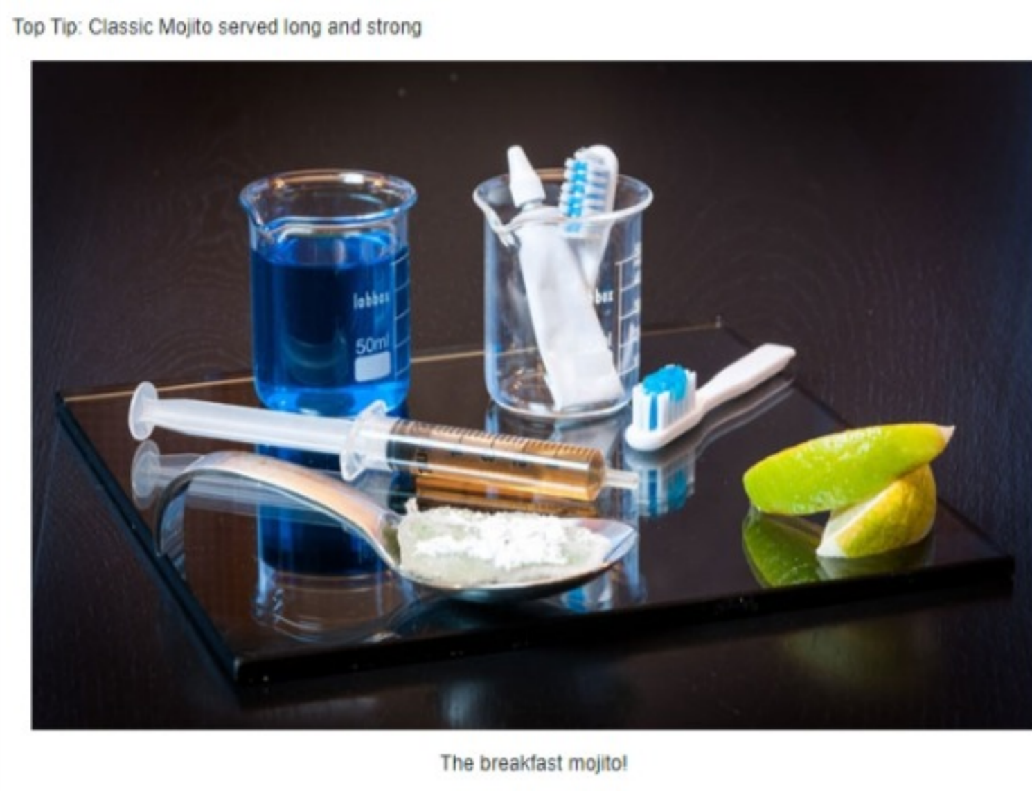
The breakfast mojito!

Top Tip: Classic Mojito served long and strong