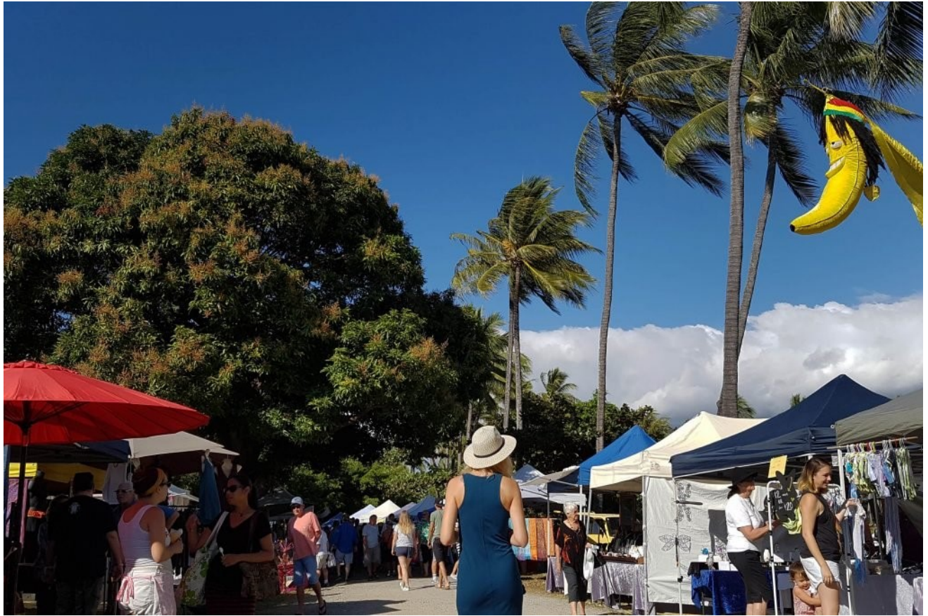
Port Douglas Sunday Market