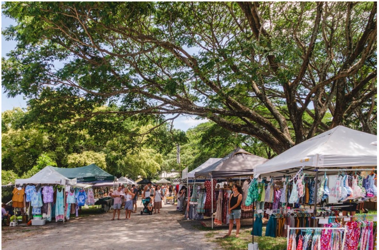
Port Douglas Sunday Market