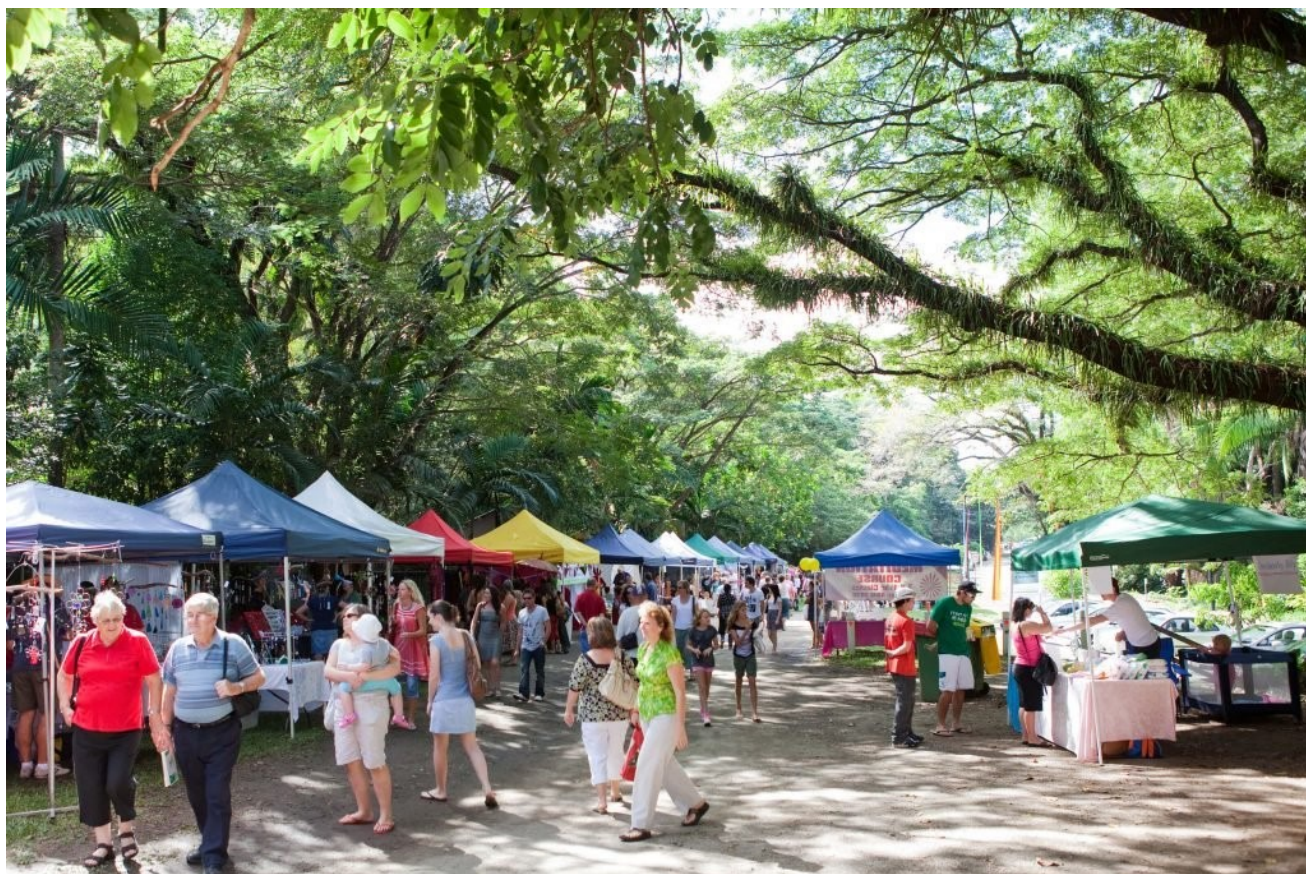
The Tanks Markets are held under beautiful big trees at the Tanks Art Centre