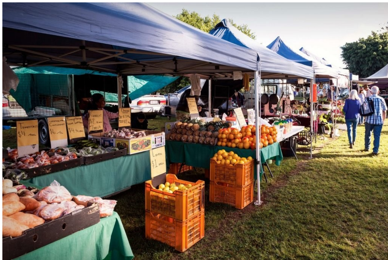
Stalls at Yungaburra Markets