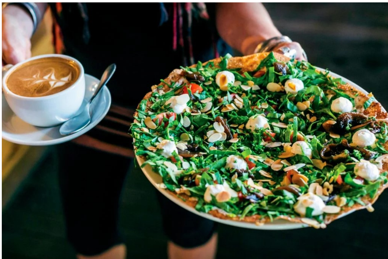
Crepe at Petit Cafe in the Original Markets