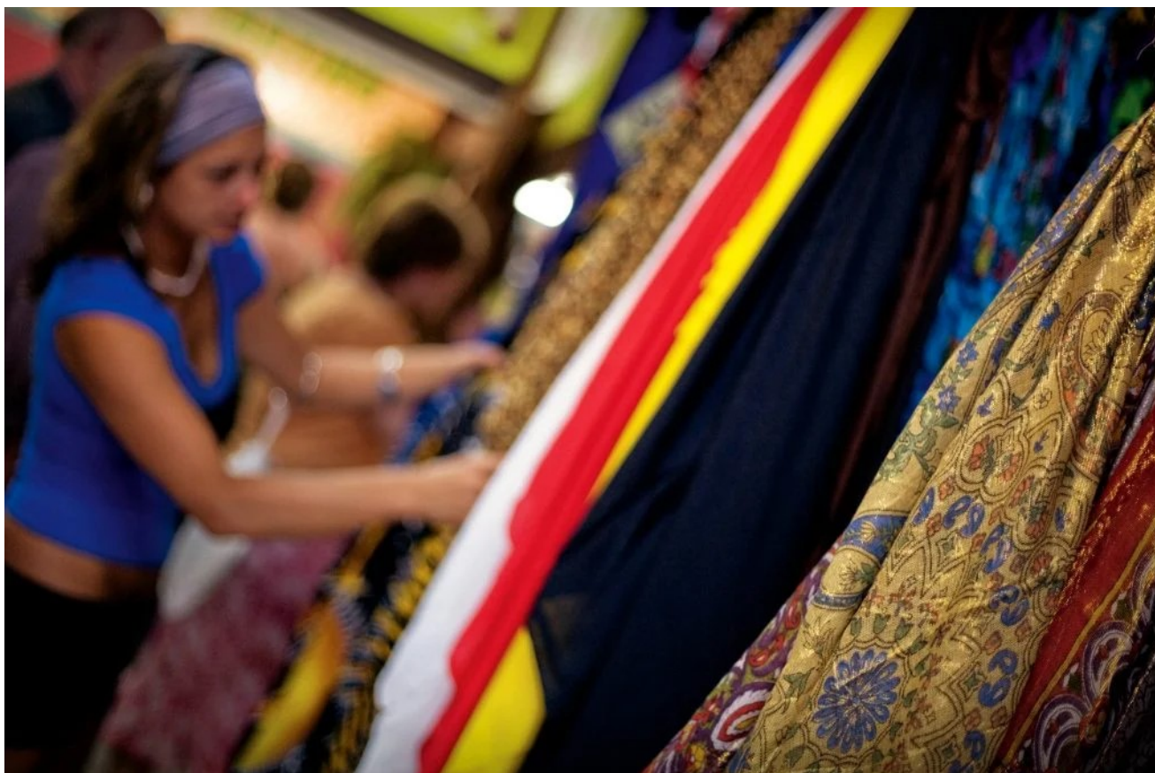
Shopping at Cairns Night Markets