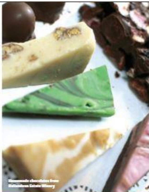
Assorted cheeses from Italianelean Estate Winery