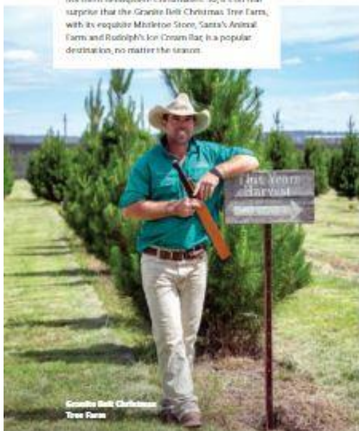
Granite Belt Christmas Tree Farm