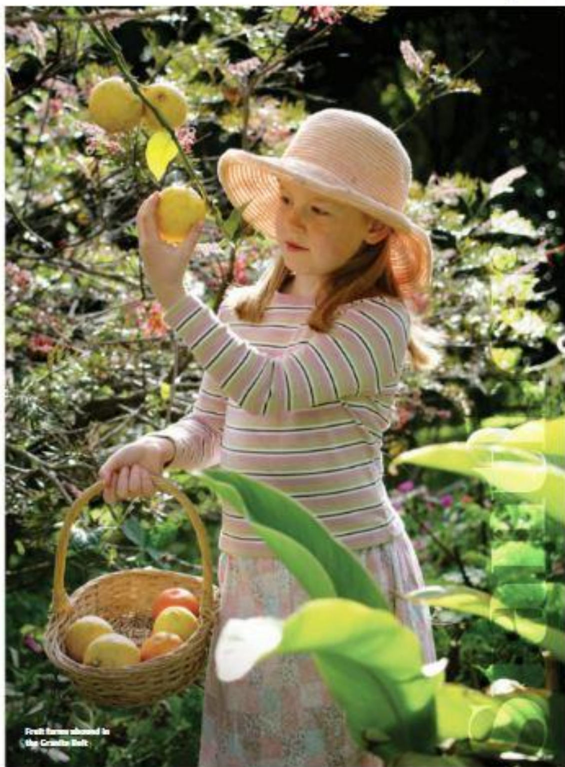
Fruit farms abound in the Cassia Belt.