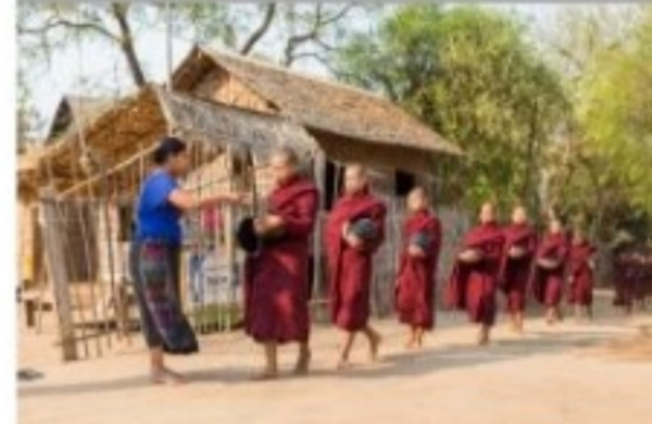
Myanmar