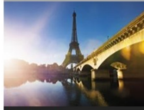
Paris City Guide