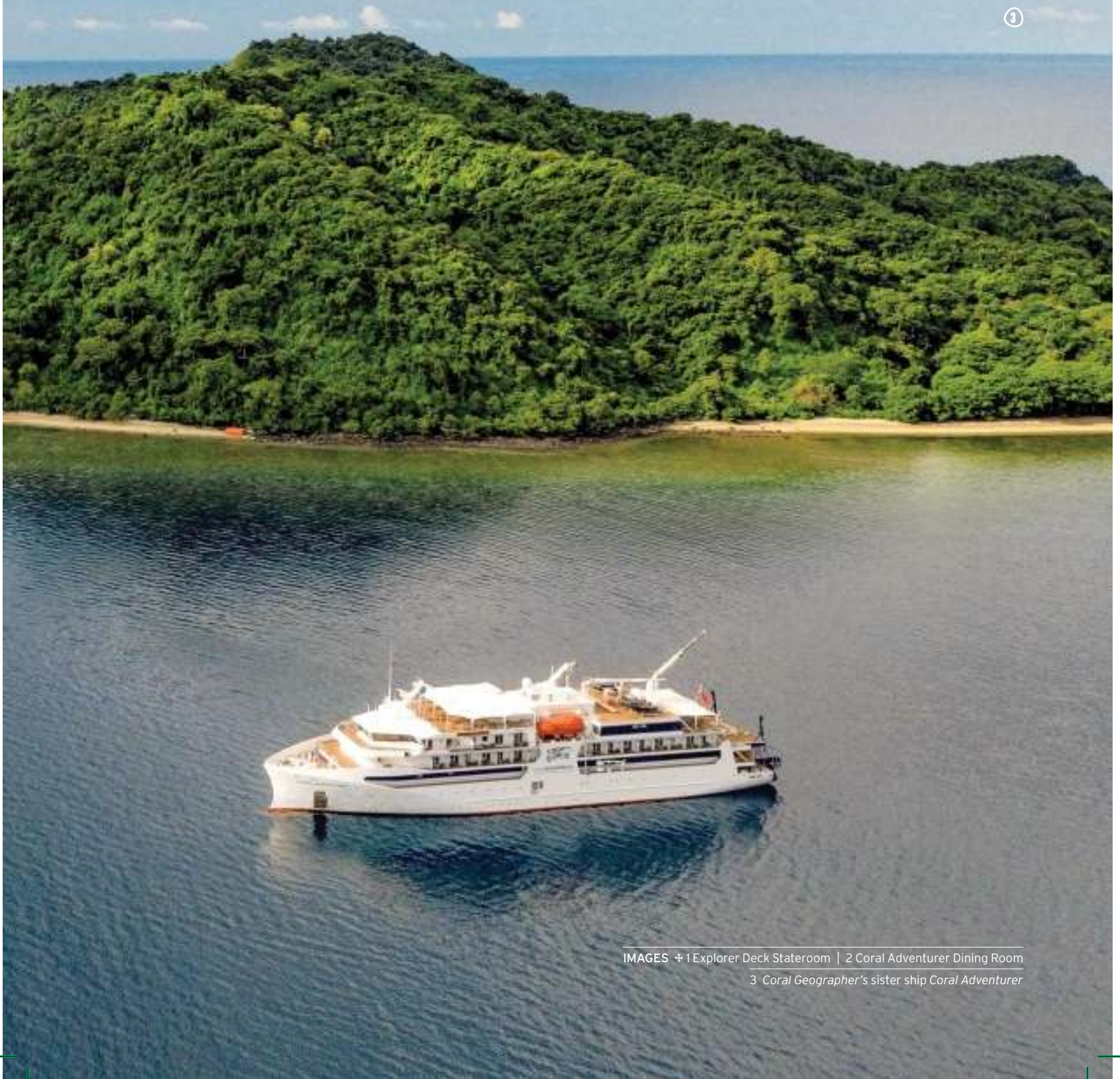
IMAGES + 1 Explorer Deck Stateroom | 2 Coral Adventurer Dining Room 3 Coral Geographer's sister ship Coral Adventurer