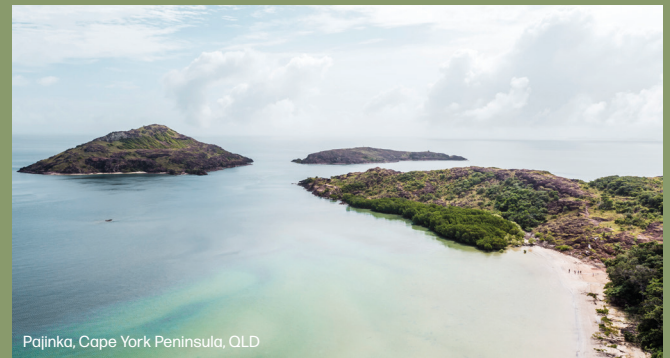
Pajinka, Cape York Peninsula, QLD

Don't miss the ultimate bragging rights photo, taken near the sign proclaiming you've made it to Australia's most northerly point. If visiting around September and October, keep an eye skywards for the meteorological phenomenon known as Morning Glory Clouds, a spectacular horizontal wave of clouds that roll through, often around dawn.