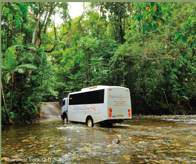
Bloomfield Track, QLD

Despite the ambiguity, what's not in dispute is the Cape's mammoth size. Covering an expanse the size of Victoria, yet with less than 1% of Victoria's population, Cape York Peninsula is a lush wilderness area few are privileged to visit. The Cape is bounded by the Gulf of Carpentaria, with its sandbar-strewn waters, to the west; the Great Barrier Reef and the Coral Sea to the east; and to the north lies Torres Strait, where more than 200 islands pepper the narrow passage separating Australia from Papua New Guinea.