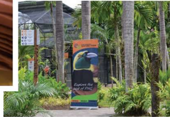
The National Museum and Art Gallery (far left); a bird of paradise at the Port Moresby Nature Park (left and below); APEC Haus at Ela Beach (opposite).