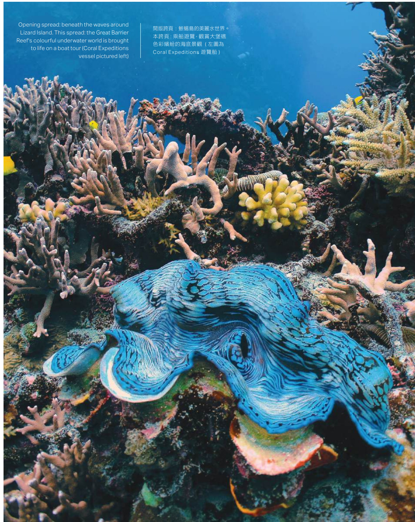
Opening spread: beneath the waves around Lizard Island. This spread: the Great Barrier Reef's colourful underwater world is brought to life on a boat tour (Coral Expeditions vessel pictured left)