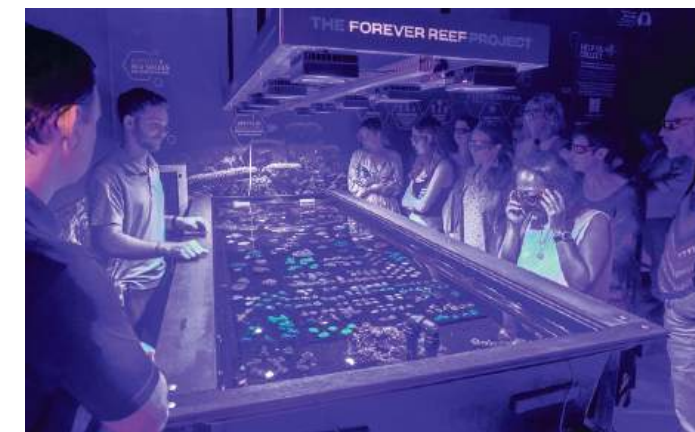
From left: snorkellers on a Quicksilver Cruises excursion spot a sea turtle; a coral nursery at Moore Reef; Great Barrier Reef Legacy's Coral Biobank in Port Douglas